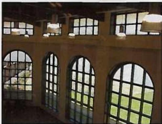
The finished interior of the Academy at Nola Dunn, featuring insulated concrete form (ICF) and integrated framing assembly (IFA) door and window openings, including 7.5-m (25-ft) daylight windows.