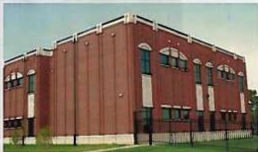
The Academy outperformed all other schools in the Burleson Independent School District (ISD) in terms of energy efficiency, thanks to its innovative use of ICFs and IFAs.

cycle costs it offers. Many buildings recently constructed with this method have also been certified to the Leadership in Energy and Environmental Design (LEED) rating program.