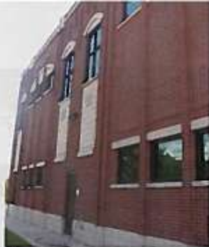
The finished exterior of the Academy, with a view of its IFA windows and door as well as one ICF wall.